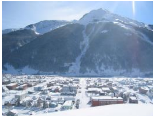
Silverton

The Silverton trip provides a great skiing experience for a bargain price. Last year's group voted overwhelmingly that the club should return again! The hotel is old and rustic with lots of character. The owner is great and will try hard to make us happy. Silverton, like all of Colorado, has a fair amount of avalanche activity. Trip planning and safety are extra important. If the snow level is below 9000 feet, which it usually is, there will be lots of ski options for all levels of skiers. For the Beginners, there is a shared snowmobile and ski trail that circles the town and continues up the scenic Animas River. The local snowmobile club grooms 125 miles of multi-use trails. Your trip will include three huge breakfast buffets and one dinner. Silverton does not have lots of gourmet dinner options, but the atmosphere more that makes up for it!