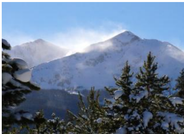
Frisco Grace & Torres Mtns.