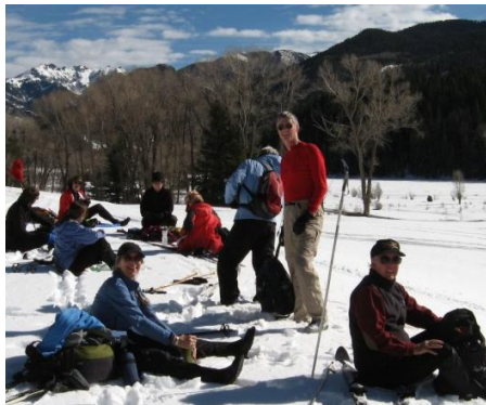
Lunch stop on the East Fork, 1/15/11.

machine was encountered the second day. This trail and other trails we skied on are maintained by the Pagosa Nordic Club. ■