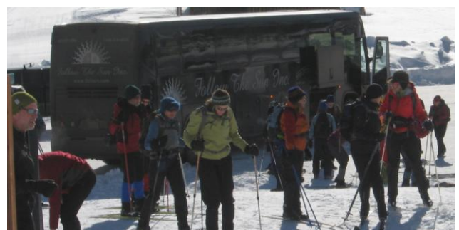
Skiers prepare to depart the bus for a day of skiing in Crested Butte, 2/12/11.