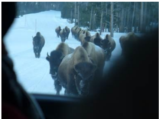
Yellowstone skiers were stopped on the road by a group of buffalo, 3/2007.